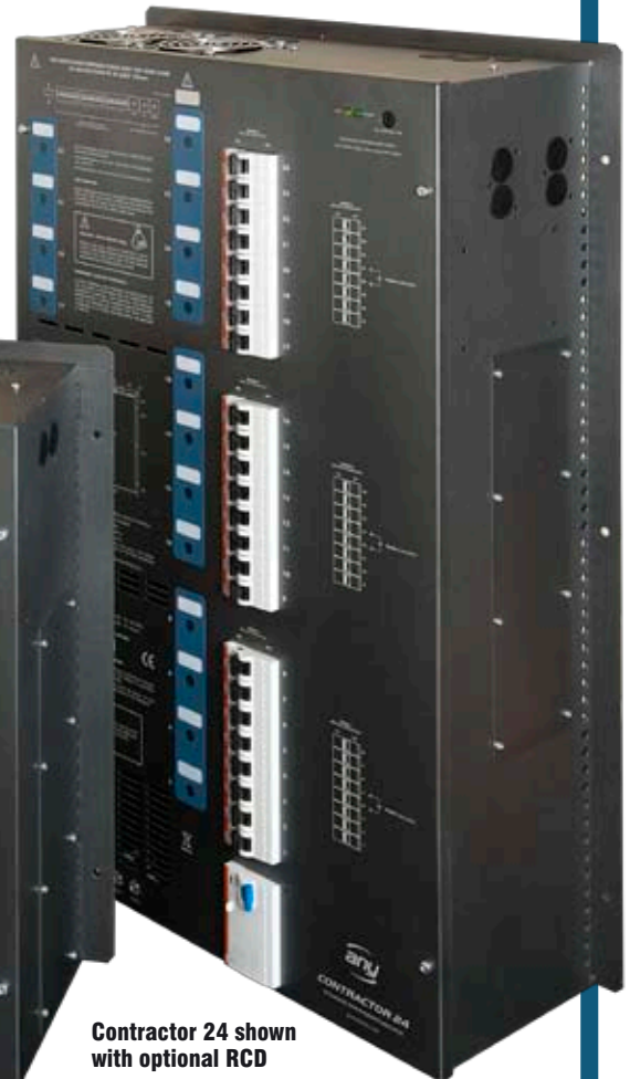
Contractor 24 shown with optional RCD